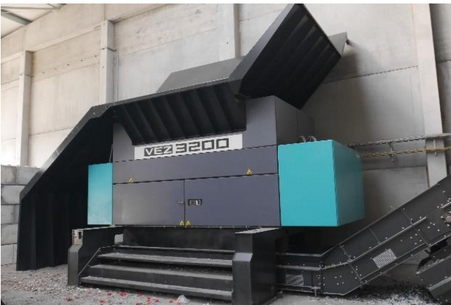
Image 4: 14 users are already using the pre-shredder successfully.