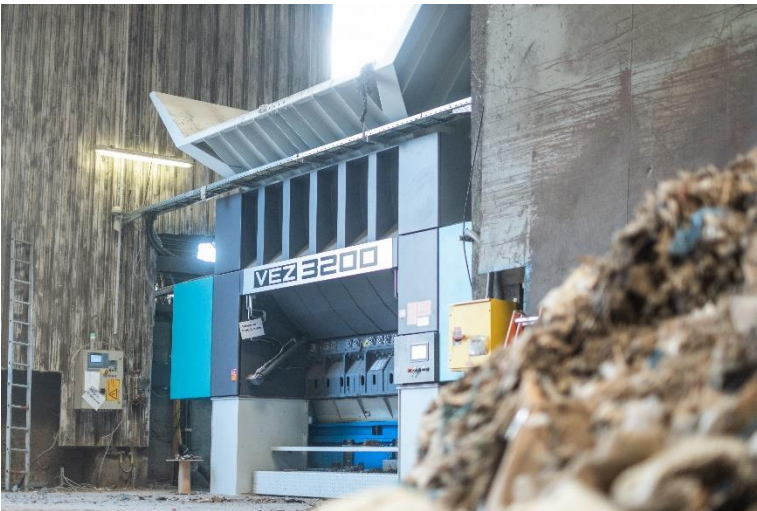
Image 1: Vecoplan has developed the VEZ 3200, a powerful single-shaft pre-shredder with high throughput.